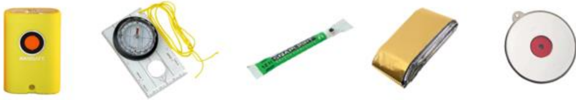
Strobe Flash Lamp – Compass – Light stick – Alu blanket – Distress mirror

You have the possibility to buy the mandatory safety equipment and to rent a sat phone on the MARLINK EVENTS e-shop.